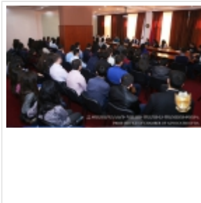
20.11.2015 THE CHAMBER OF ADVOCATES OF RA HOSTED YSU STUDENT OF FACULTY OF LAW

BACK $(window).load(function(){ if(typeof $(".fb_comments_count").html() != "undefined" && parseInt($(".fb_comments_count").html()) != 0){ updateCommentsCount(window.location.href); } })