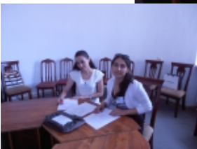
PREV_NEWS: ADVOCATES MEETING FOR ELECTION OF THE REGIONAL COORDINATORU OF SHIRAK AND SYUNIQ MARZES